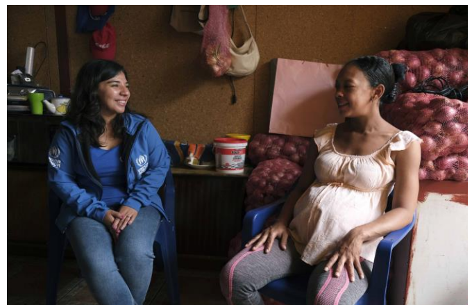
Figure 1. Arica, Chile. UNHCR staff visiting a Cuban asylum-seeker hosted in the country.