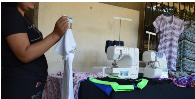
Young woman shows a shirt made in one the livelihoods projects which provides serigraphy and printing services. These initiatives are directed to internally displaced and deported persons with protection needs.