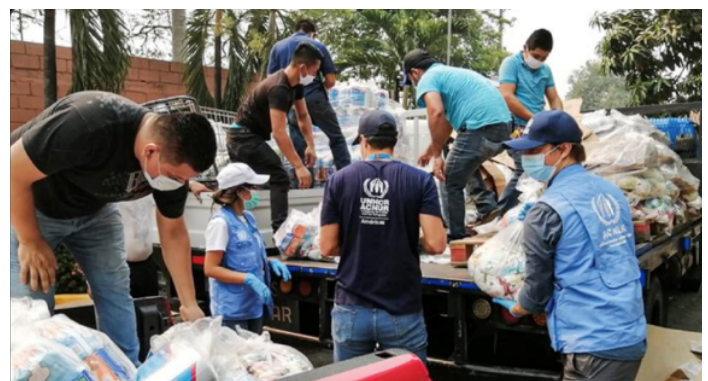
In Honduras, UNHCR coordinates with the Municipality and community committees, the delivery of 1,000 assistance kits to population in situation of vulnerability during the pandemic, including internally displaced people and people at risk of violence.

Apart from coordinating the response with local governments, UNHCR works with UN agencies and partners to deliver assistance and protection in NCA countries. In this respect, UNHCR leads Protection Groups or Clusters under the coordina-