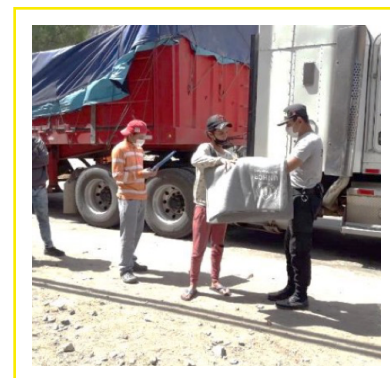
Humanitarian support in Cuzco by UNHCR- Regional Government

More than 640 persons of concern are receiving shelter and daily food support in 20 shelters/collective accommodations supported by UNHCR in Lima, Tacna and Tumbes. A set of guidelines was developed to be operative in all shelters aiming to safeguard hygiene and health conditions.