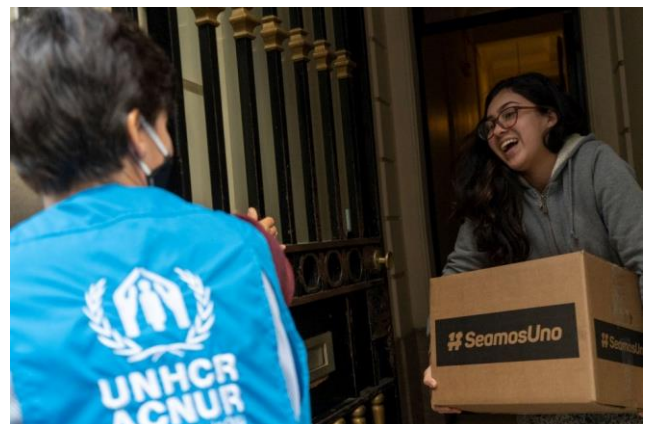
Venezuelan receiving food boxes amidst the COVID-19 pandemic in Buenos Aires

41 National staff 10 International staff