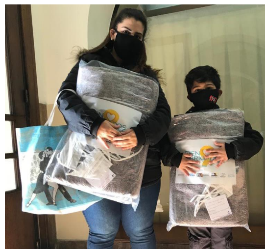
Venezuelan family receiving winter kits amidst the COVID-19 pandemic in Buenos Aires