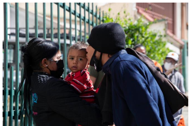
Venezuelan family during a winter items distribution in La Paz