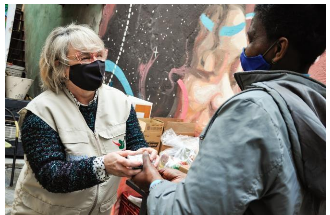
During the COVID19 pandemic, UNHCR together with partner agency "Idas y Vuelitas" distributed hygiene kits for refugees.