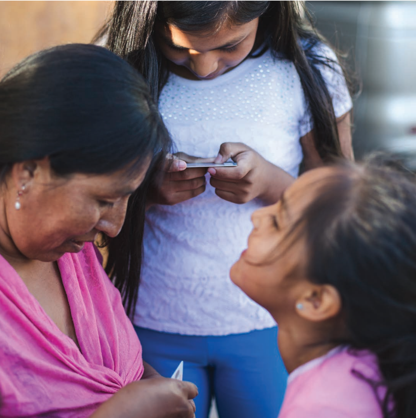
#Chilereconoce project. Iquique, Chile.

Late registration refers to the registration of a vital event after the period established in the existing laws or regulations of each State. Since late registration proceeds after the “grace period” established by each State, evidence requirements increase. In some countries, the procedure for the late registration of births can be resolved on an administrative level, while in others they can only be processed before the courts or a combination of both.