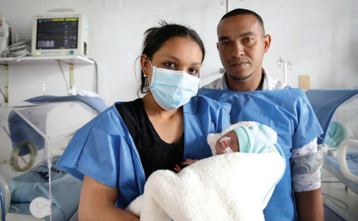
Primero la Niñez project, Colombia.