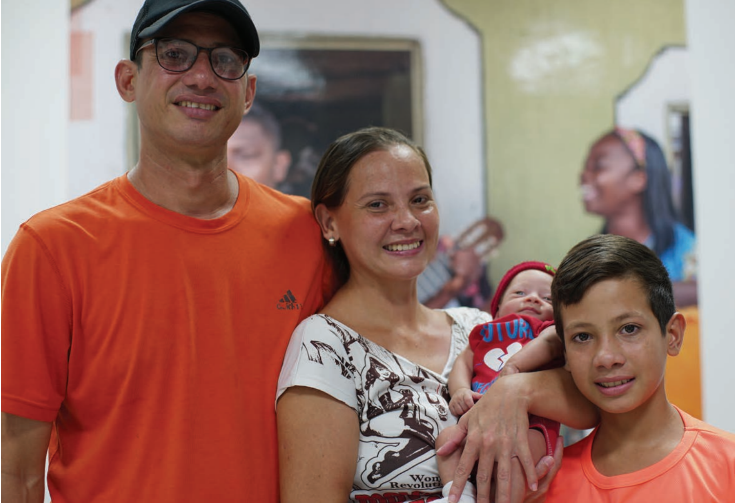
Primero la Niñez Colombia project.