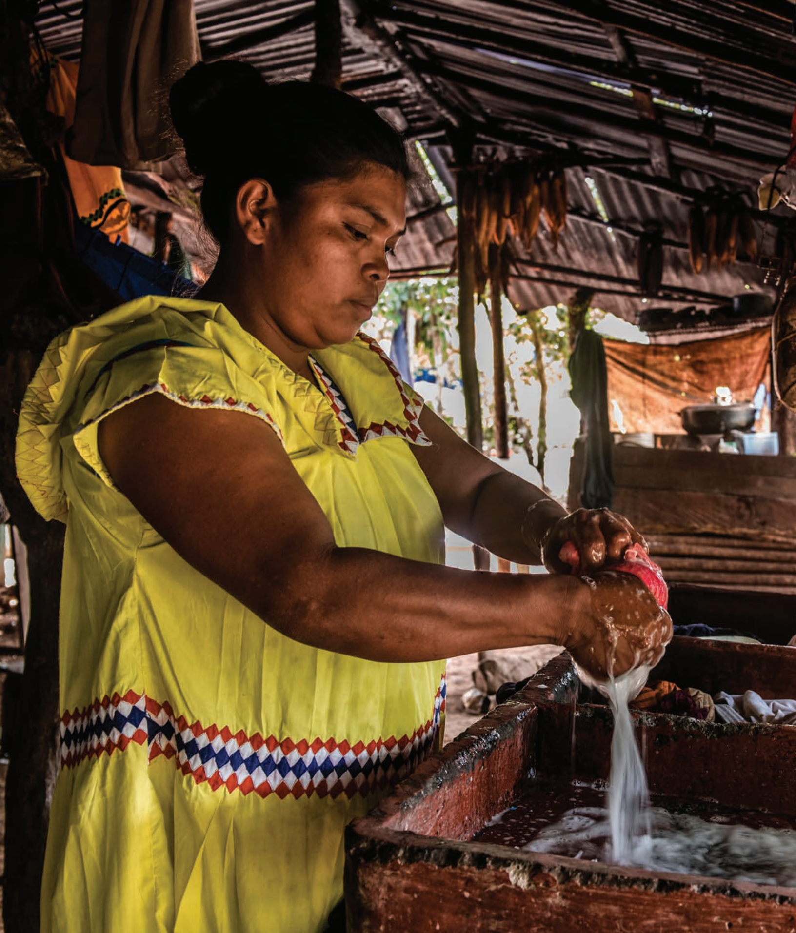
Chiriticos project. San Vito de Coto Brus, Costa Rica.