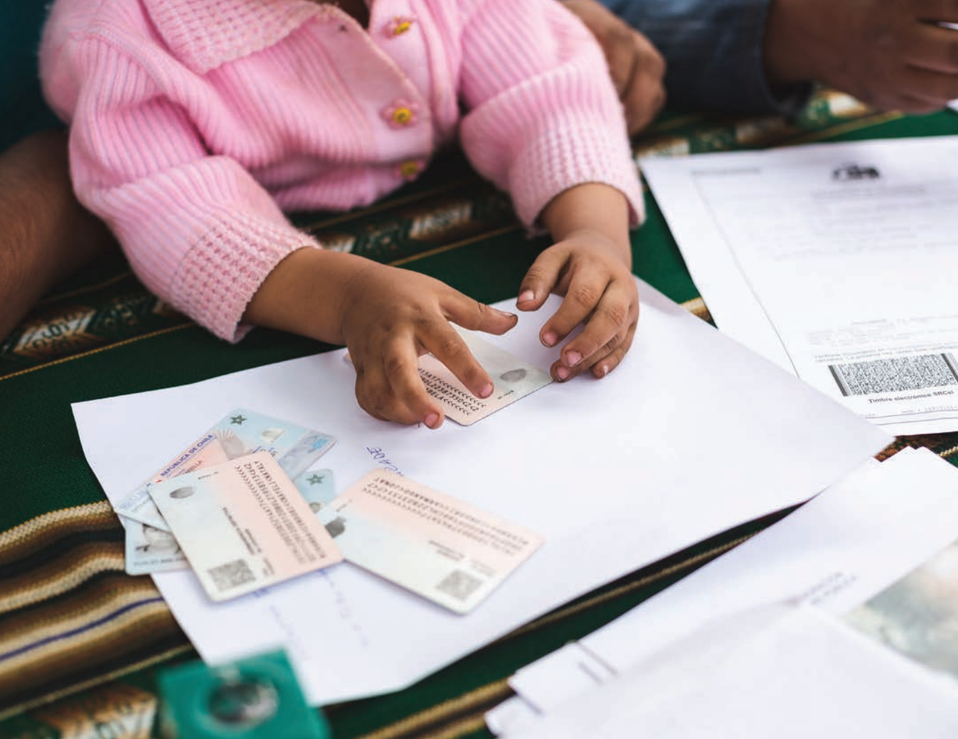
Proyecto #Chilereconoce. Iquique, Chile.