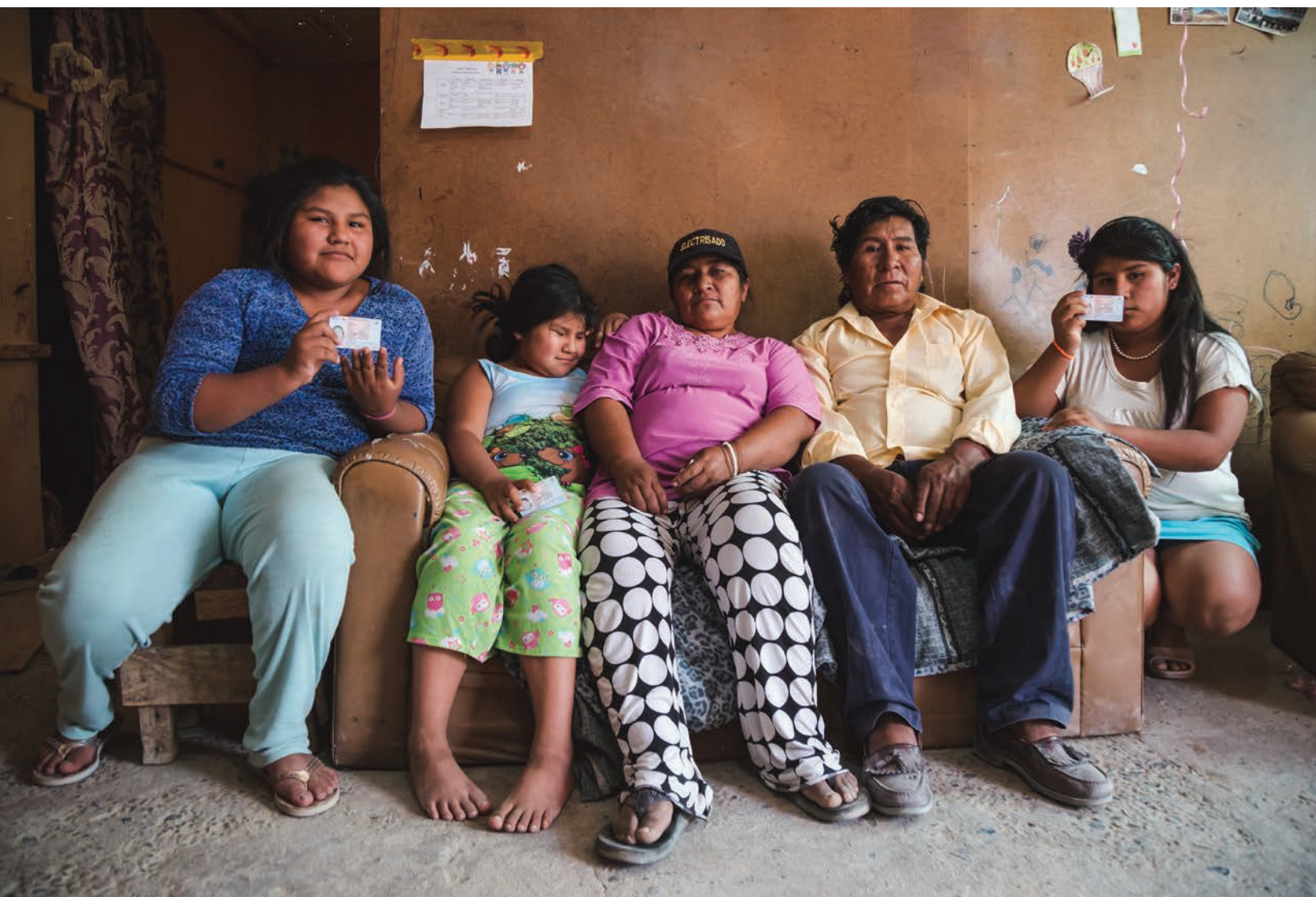
#Chilereconoce project. Iquique, Chile.

Given that the obstacles to late registration can be similar to those faced by stateless persons, the guidelines developed by UNHCR for the burden of proof could be used and the burden of proof can be shared. The informant would have the obligation to explain their situation as completely and truthfully as possible, and present all of the evidence that is reasonably available. The CR authority would be obliged to obtain and present the evidence that is reasonably available 484 . The burden of proof cannot be disproportionate or unduly difficult to obtain 485 .