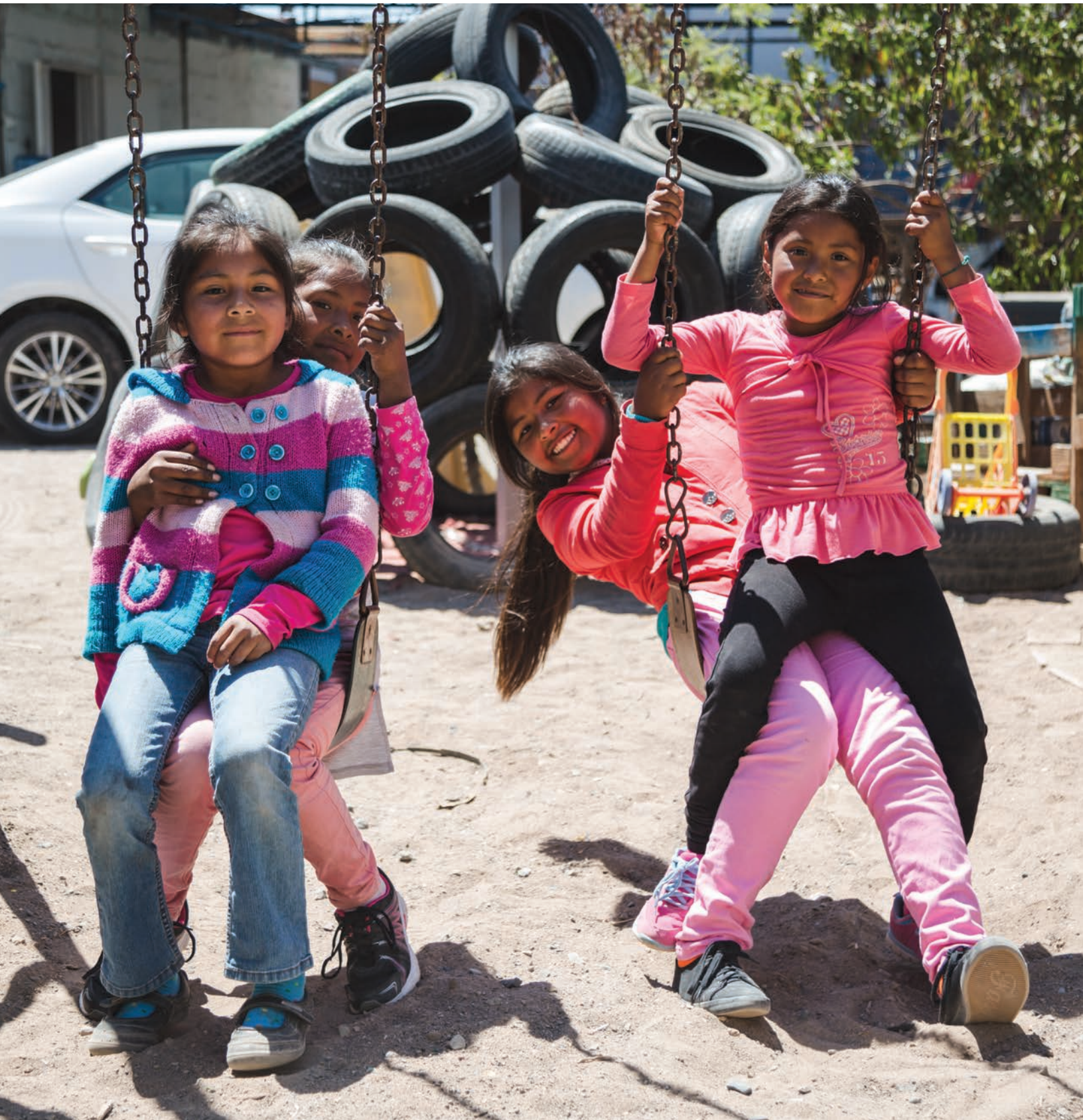
#Chilereconoce project. Iquique, Chile.