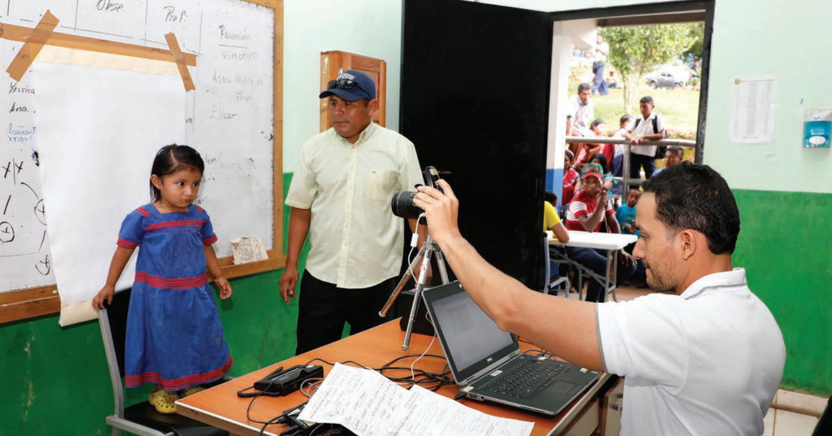
Field Mission to Tapón del Darién