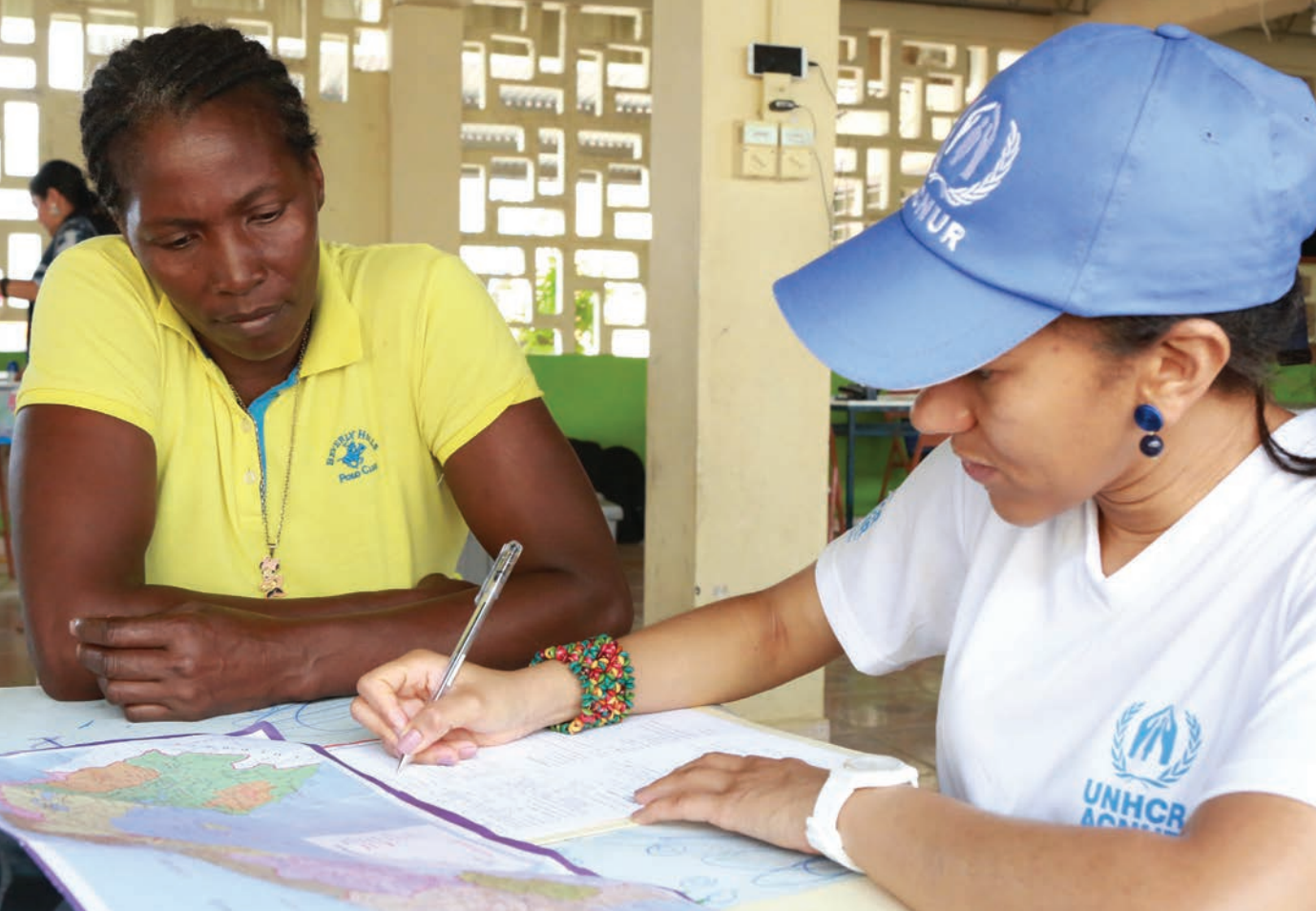
Field mission to Tapón del Darién