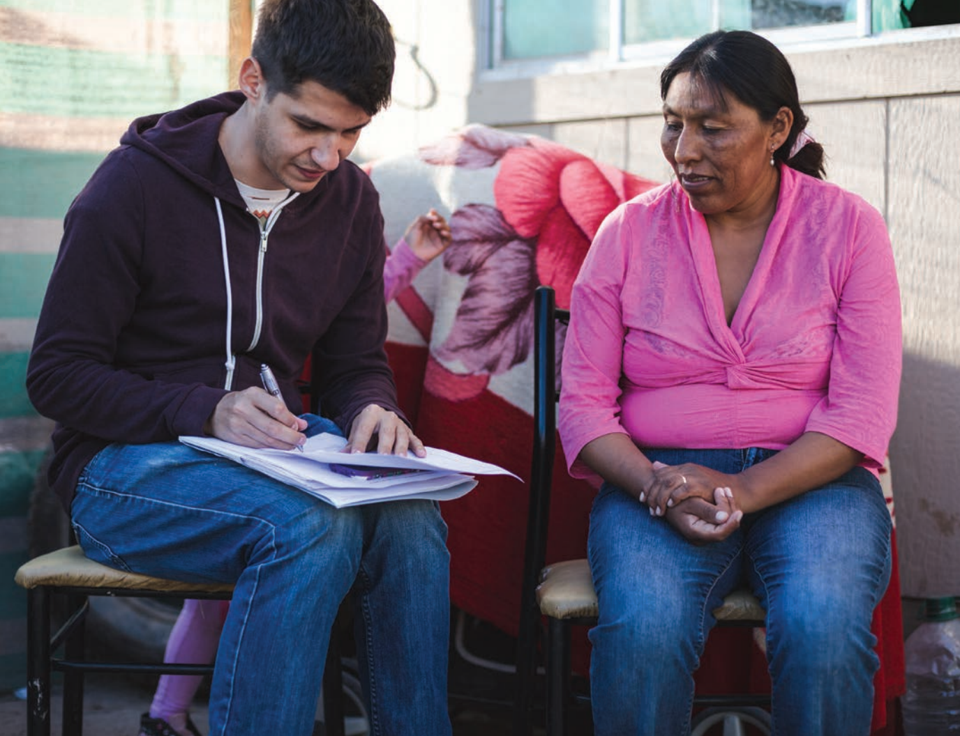
#Chilereconoce project. Iquique, Chile.