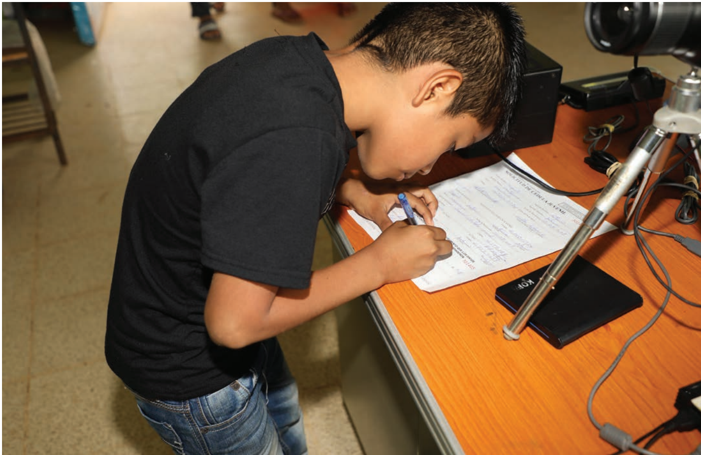
Field mission to Tapón del Darién

The countries included in the study do not charge fees or tariffs for the timely registration of births, providing the birth certificate to the minor free of charge. Only Guatemala charges for the printing of the first birth certificate after registration. In terms of late registration, the costs indicated include the issuance/printing of the birth certificate 432 :