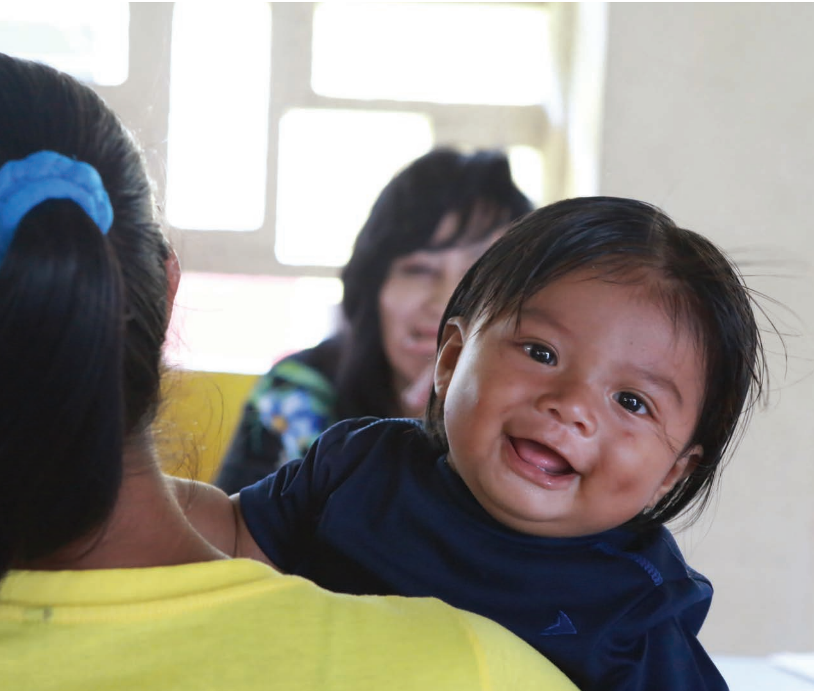
Field mission to Tapón del Darién

nationality. Additionally, in human mobility situations, the lack of an identity document that proves the nationality of the parents becomes one of the main obstacles for registering births that took place in the host countries, as well as registering births with the consulates of their country so that they acquire or confirm their nationality by consanguinity. The lack of an identity document that proves nationality prevents children from gaining access to their basic rights and exposes them to increased protection risks, particularly in human mobility contexts.