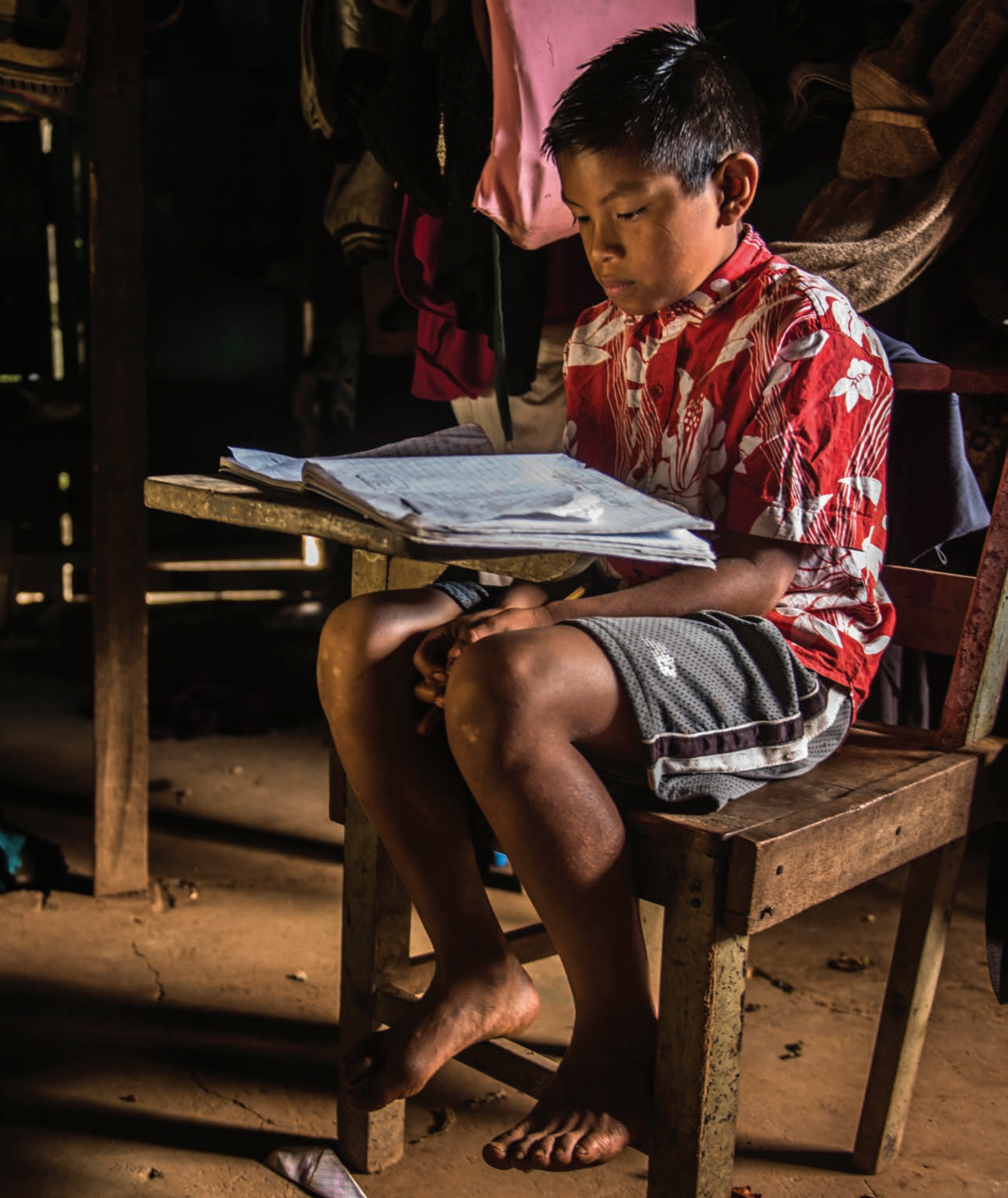
Chirricos project. San Vito de Coto Brus, Costa Rica.