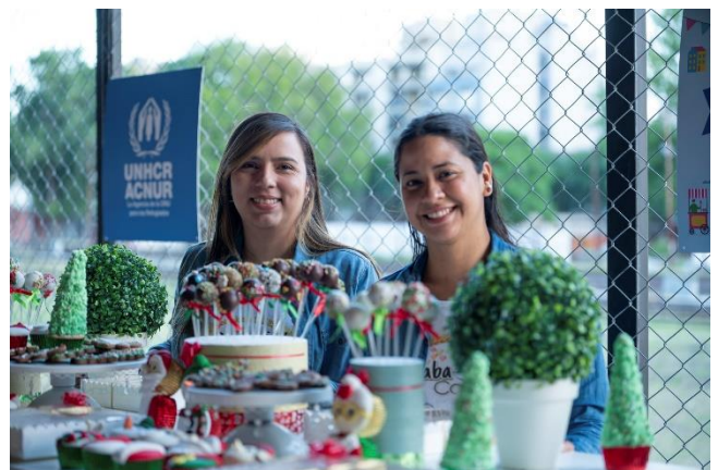
Venezuelan entrepreneurs offering their products during the Festival del Reencuentro in Buenos Aires.

Field presences in Cordoba, Mendoza and Salta