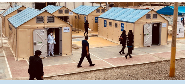
The RHU served as spaces for triage, medical appointments and treatment.

A total of 206 Refugee Housing Units (RHU) have been donated to health facilities since March 2020 in districts with a high concentration of Venezuelan population . Since the start of the state of emergency in March 2020 due to the pandemic, UNHCR has assisted the Ministry of Health supporting the urgent response to the increasing number of COVID-19 cases among the refugee, migrant and host communities.