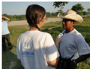
El Río habla , weekly broadcasting in Radio Sucumbios, allows frontier population explaining their concerns.