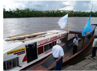
Medical ship allows accessing a public health service in far-off areas