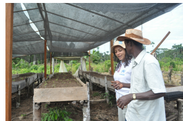
Farming workshops help borderline communities to improve food safety and production.