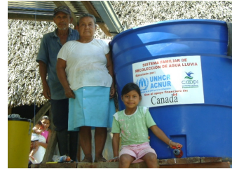
Safe water system in El Litoral, Putumayo River.