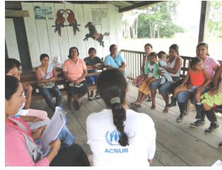
Participatory Assessment in Putumayo River community