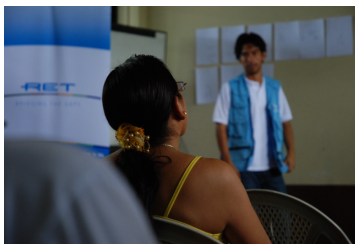
UNHCR holds regular workshops with public and private institutions on refugee issues.