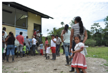
New primary school in Villahermosa, Río San Miguel