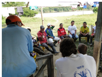
Implementing partners and authorities join participatory assessments.