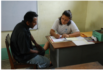
Legal assistance is also provided in communities.