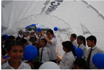
International Child Day in Lago Agrio