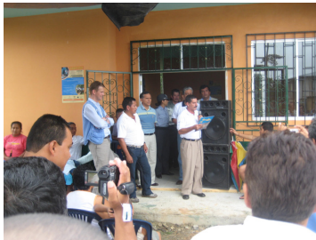
Opening of a health center in San Miguel River.