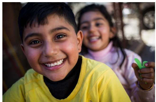
Photo: Pakistani children refugees in Bolivia

Presence in Arica, Chile - 3 National staff