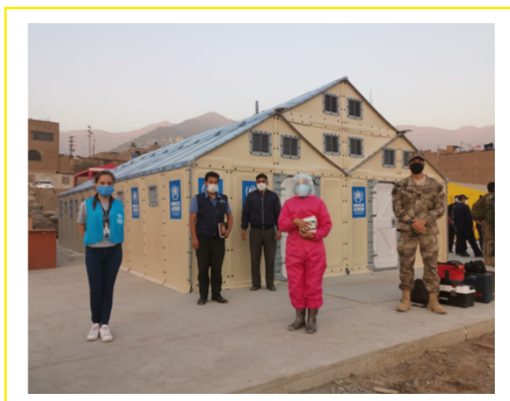
RHUs set-up to enhance hospital response to COVID19 in Lima.

Some 720 primary health orientations have been carried out in Lima and Tumbes by UHCR and partners.