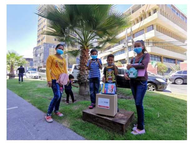
Beneficiaries in Iquique receiving humanitarian kits

donors Funding (16 march 2021) USD 38.9 M