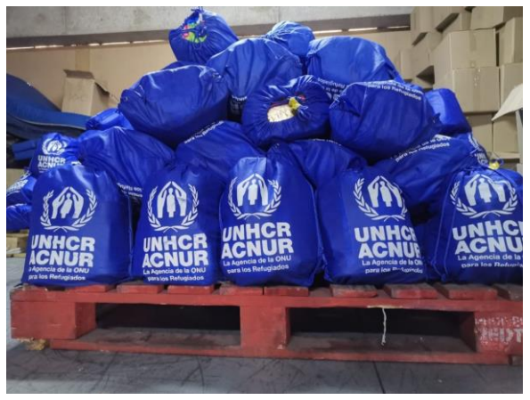
UNHCR donation to the Municipalities of Iquique and Huara