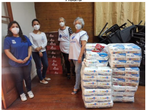
Delivery of milk formulas and diapers to the Bishopric of Iquique

UNHCR has continued to deliver humanitarian assistance to refugees and migrants from Venezuela and continues to assess the situation in Chile. With the support of the Municipalities of Colchane, Huara and Iquique, in February the UNHCR delivered 3,000 food and hygiene kits.