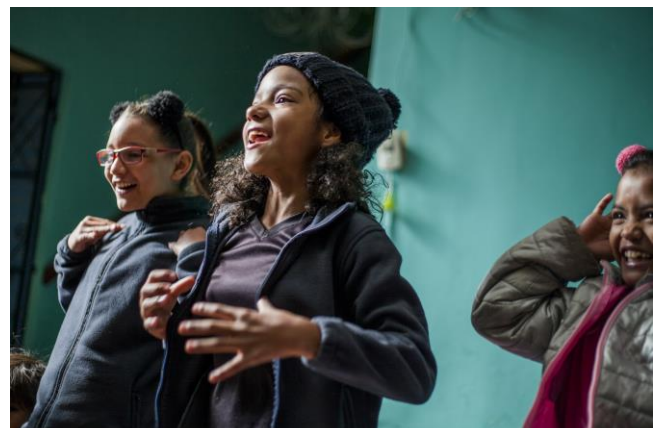
Venezuelan children doing recreational activities in a child friendly space in La Paz