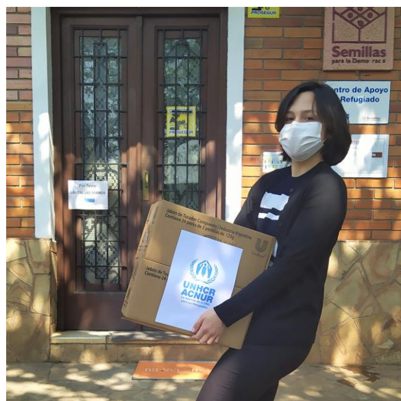
During COVID 19, UNHCR worked together with partner agency "Semillas para la Democracia" to bring humanitarian assistance to refugees.