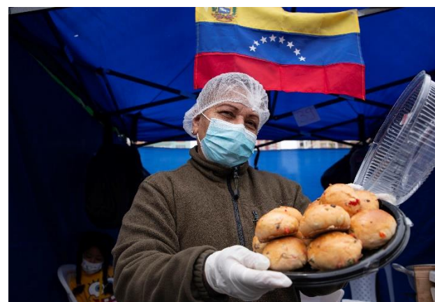
Venezuelan entrepreneur during a fair in La Paz.