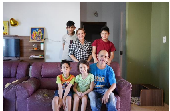
Venezuelan family starts a new life in Asunción.