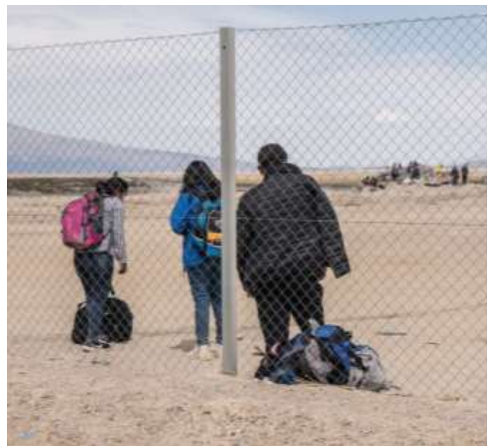
Refugees and migrants crossing from Pisiga, Bolivia, to Colchane, Chile by unauthorized entry points.