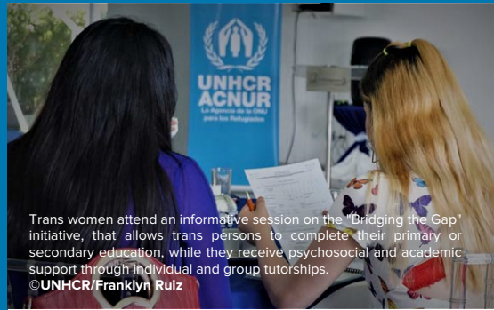
Trans women attend an informative session on the "Bridging the Gap" initiative, that allows trans persons to complete their primary or secondary education, while they receive psychosocial and academic support through individual and group tutorships.

A donation of books, furniture, and IT equipment will improve the services planned to provide at five new community centres, known as CUBOs, that plan to open during October and November. The community facilities in El Tamarindo, San Jose, Panchimalco, Santa Lucia and Apopa communities will contribute to the recuperation of public spaces and the prevention of forced recruitment of children and youth.