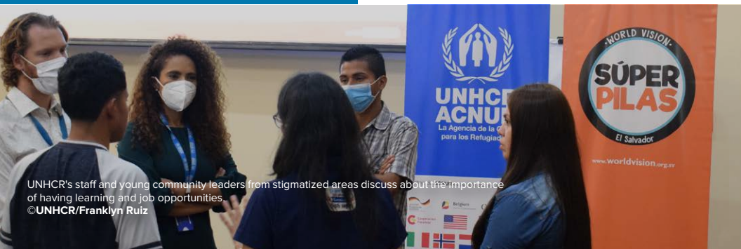
UNHCR's staff and young community leaders from stigmatized areas discuss about the importance of having learning and job opportunities.

UNHCR and the Ministry of Labour and Social Welfare enrolled additional 13 displaced persons from San Salvador, Santa Ana, Sonsonate, and Ahuachapán in "My First Job" programme. By the end of September, the programme matched 204 people with jobs in the formal sector and ensured access to social security.