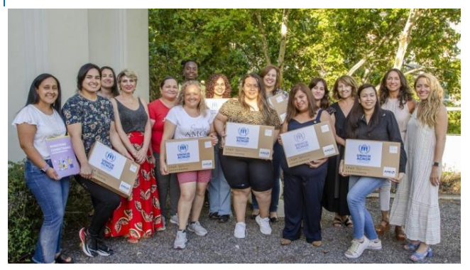
Refugee woman who learned programming thanks to the UNHCR project