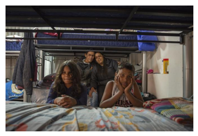
Refugee family in transit in Bolvia hosted in a temporary shleter in La Paz