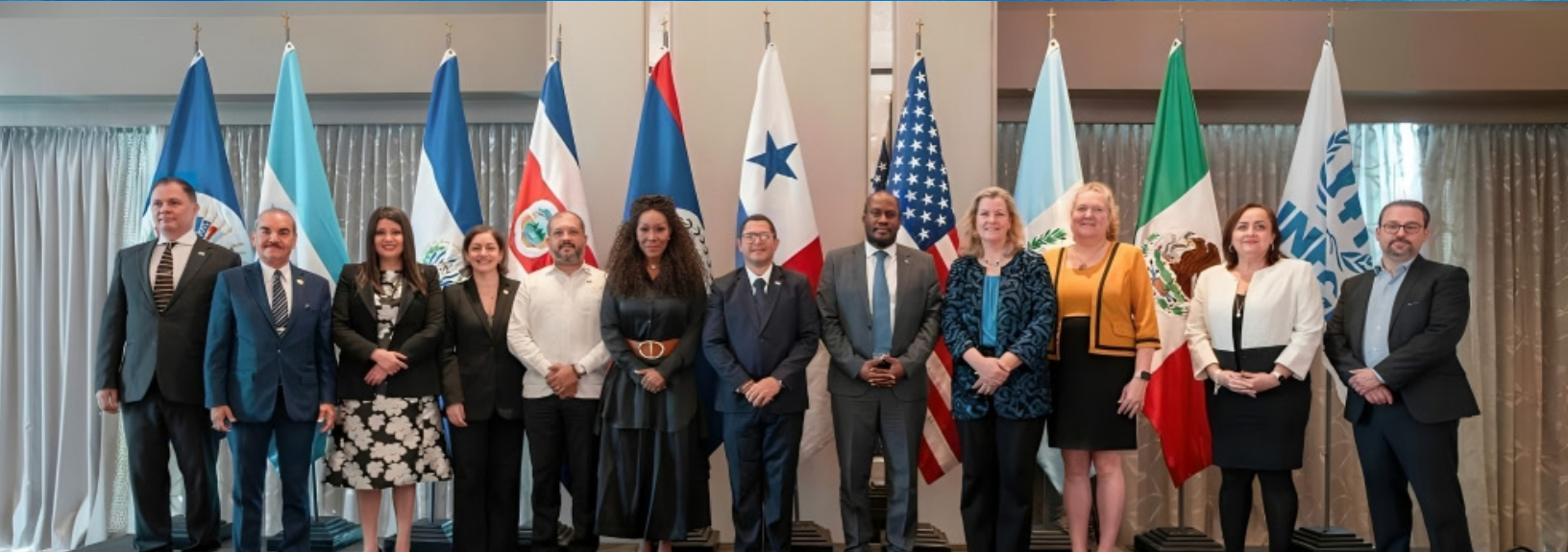
The VI Annual Meeting of MIRPS highlighted the solidarity and shared responsibility among States, donors, international financial institutions, and civil society.