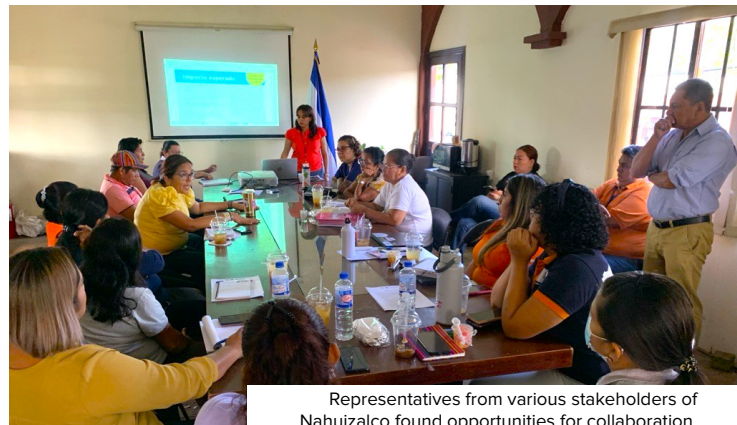
Representatives from various stakeholders of Nahuizalco found opportunities for collaboration.