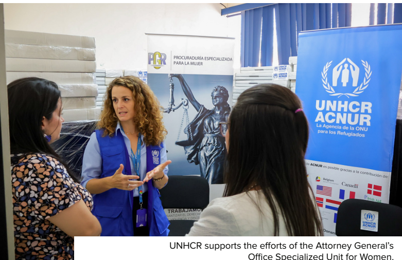
UNHCR supports the efforts of the Attorney General's Office Specialized Unit for Women.