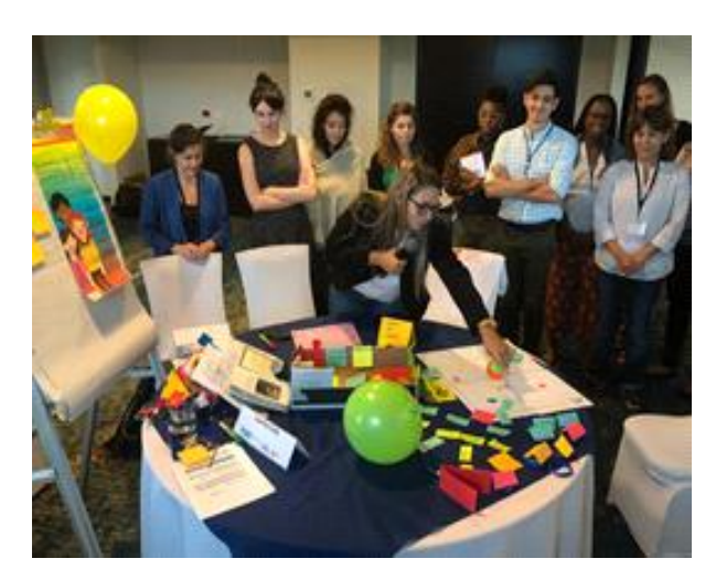
Day 2: a group of participants present their ideas on Safe Spaces for refugee and displaced children

A world café session was also held to discuss other key challenges and best practices related to Mandatory Reporting, Protection from Sexual Exploitation and Abuse (PSEA) and Complaint Mechanisms, and Survival Sex.