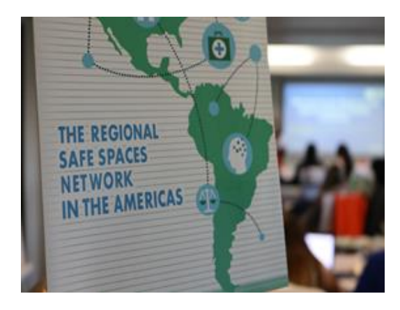
Material used during the RSSN workshop 2018

The first day concluded with an open Gallery Walk . The session provided an open space for RSSN members, government agencies and NGOs to present their best practices and products related to the RSSN and/or SGBV and Child Protection case and information management. The gallery walk proved to be an efficient tool to promote regional collaboration and cross-fertilization of successful practices.