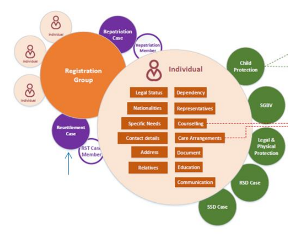
ProGes V4 Outline

During the workshop, participants mentioned the usefulness of the RSSN workshop and that they wanted to replicate the activities presented in their own operations. They also appreciated the inclusive methodology applied and were grateful that they could work as a team throughout the workshop. There was an overwhelming positive response to the training session on the SGBV and CP modules in proGres v4.