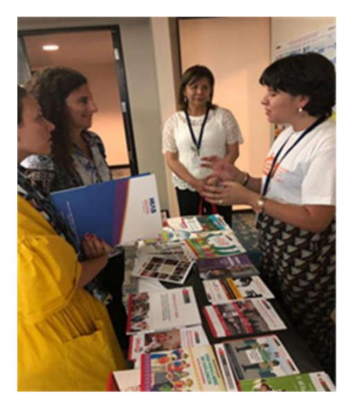
Day 1 RSSN Focal Point present the Network in Peru

The first day: the event opened with an overview of the Regional Safe Spaces Network (RSSN), its origin, objectives, key principles, membership and activities. The presentation of the RSSN toolkit by RSSN focal points from different countries followed the opening session. Key tools discussed by participants included the standard RSSN Terms of Reference, the RSSN self-audit check-list, the RSSN online map, the interagency protection referral form, the SGBV and CP interagency referral pathways, the SGBV and CP case management flowchart, and the Regional Information Sharing Protocol.