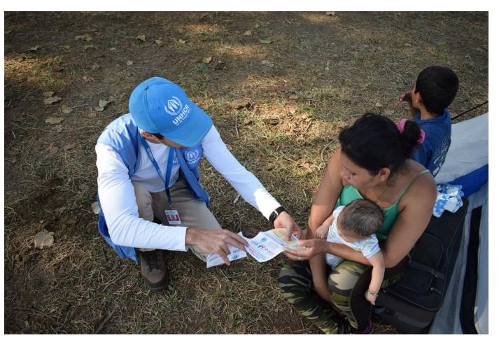
Tecun Uman, border with Mexico. UNHCR staff provides information on asylum procedures in Guatemala and Mexico to people within large movements.

Most recently, people from NCA have resorted to travel in small groups in the hopes of reaching Mexico and the United States. They flee within mixed movements of refugees and migrants.