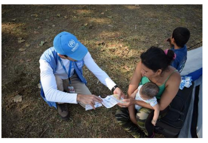
Tecun Uman, border with Mexico. UNHCR staff provides information on asylum procedures in Guatemala and Mexico to people within large movements.

Most recently, people from NCA have resorted to travel in small groups in the hopes of reaching Mexico and the United States. They flee within mixed movements of refugees and migrants.