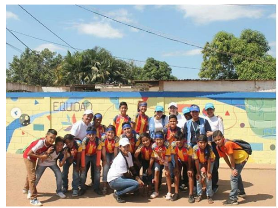
Zulia, Venezuela: Youth Mural Project "Niño Autor" La Red Hilos de Esperanza & RSSN members (April 2019)

An Interagency Protection Coordination Mechanism in the Americas