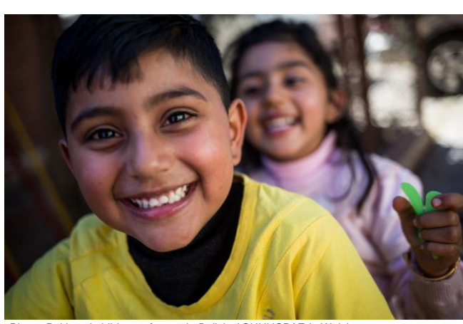
Photo: Pakistani children refugees in Bolivia

National Office in Santiago, Chile – 1 international staff, 13 staff National staff, 1 ERT and 2 UNOPS. Presence in Arica, Chile - 3 National staff