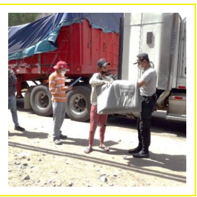
Humanitarian support in Cuzco by UNHCR- Regional Government

More than 640 persons of concern are receiving shelter and daily food support in 20 shelters/collective accommodations supported by UNHCR in Lima, Tacna and Tumbes. A set of guidelines was developed to be operative in all shelters aiming to safeguard hygiene and health conditions.