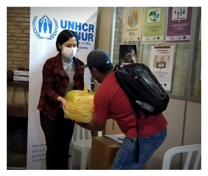
Photo: UNHCR supports refugees and migrants in Paraguay