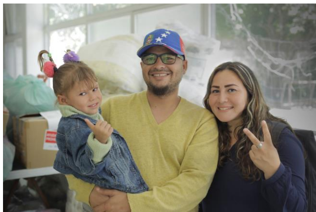
Venezuelan family receiving winter items in Montevideo