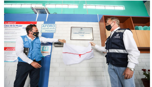
Watch “Casa de la Mujer” opening ceremony

Over 7,620 protection cases have been followed-up through specialized case management services of UNHCR and partners since the start of the Emergency.