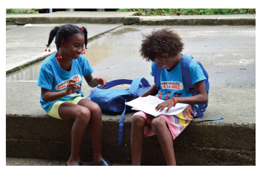
UNHCR in coordination with its partner, Fundescodes, provides child-friendly spaces for boys, girls and adolescents in Buenaventura, Valle del Cauca department.

The operation's mixed protection and solutions strategy ensures that IDP interventions are in line with this new policy, with priorities including: