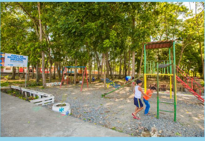
Implementing partner: FEPP Budget: USD $12,000