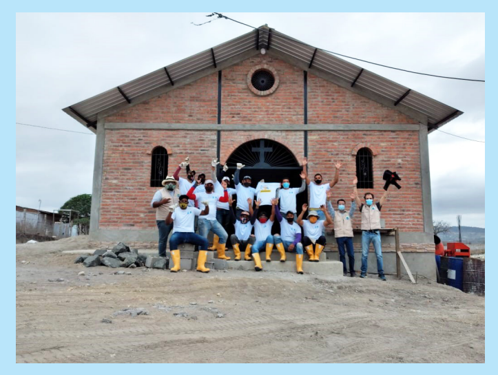
Implementing partner: AVSI Budget: USD $18,927