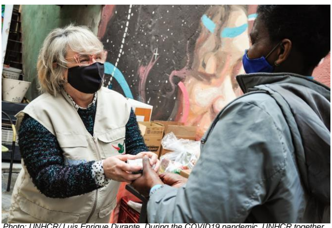
During the COVID19 pandemic, UNHCR together with partner agency "Idas y Vueltas" distributed hygiene kits for refugees.