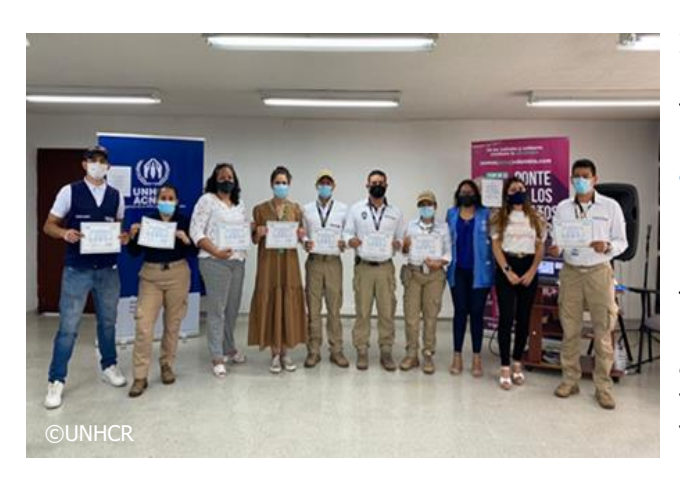
International protection workshop provided by UNHCR staff to Migración Colombia officers to enhance their response and tackle xenophobia.

In support of Migracion Colombia's regularization process of Venezuelan refugees and migrants through the TPS, UNHCR carried out a total of 12 capacity building workshops on international protection routes and antixenophobia with the participation of 150 Migracion Colombia civil servants and local authorities in major departments, part of the initiative #Micasaestucasa.