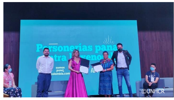
Rigorberta Menchú, Guatemalan Nobel Peace winner, and Colombian singer Andriana Lucía, participated in the "Ombudspersons Against Xenophobia" event and shared their messages on about solidarity and integration.

The number of Venezuelans fully vaccinated against COVID-19 corresponded to only 2% (37,035 people) of a total of 48% Colombian population fully vaccinated with over 56 million doses of COVID-19 vaccines. New vaccination points for Venezuelan refugees and migrants opened in the municipalities of Facatativa, Madrid, Mosquera, Soacha, Cota and Zipaquira (Cundinamarca) and in departments bordering Venezuela. UNHCR together with IOM and the Ministry of Health carried out health affiliation campaigns benefiting 22,287 Venezuelan refugees and migrants as well as capacity building workshops with 7,137 government employees and 14,859 Venezuelans.