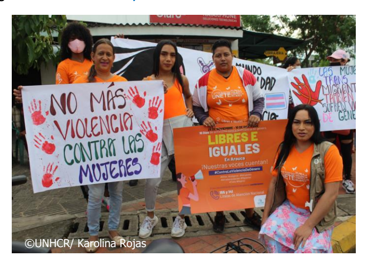
Women and LGTBI+ Community members in Arauca celebrating the 16 days of activism against gender-based violence in November 2021.

Gender based violence (GBV) knows no nationality, no age and no gender. Since the start of the COVID-19 pandemic gender based violences spiked both in Colombian homes and among the Venezuelan refugees and migrant population, particularly the LGBTIQ+ community. Compared to 2020, between January and November 2021, UNHCR has registered 338% more cases of woman at risk and 301% of GBV cases. UNHCR exapanded its network of Safe Spaces in 8 departments to offer legal and psychosocial assistance, temporary housing, food and protection pathways to GBV victims.