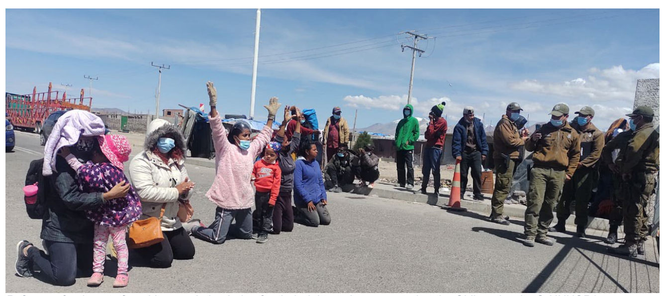
Refugees & migrants from Venezuela imploring for their rights to be respected at the Chilean border