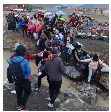
Refugees and migrants crossing in Colchane by irregular points. - Chilean border

against irregular migration and crime in the northern region have taken place, with a fired up a discourse against the UN and its work. This has been paired with the omicron variant rise of COVID-19 cases in the northern region over the first months of the year.