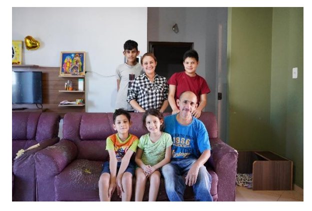
Venezuelan family starts a new life in Asunción.