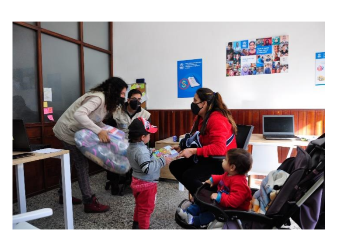
UNCHR and partner agency Idas y Vueltas deliver coats to refugee and migrant families entering Uruguayan territory in the PAO of Chuv.