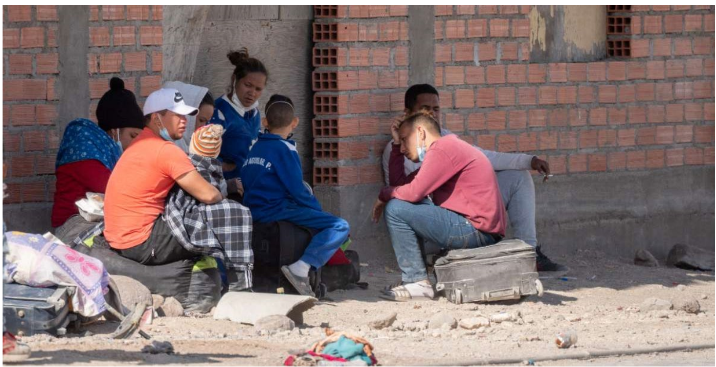
Refugees and migrants from Venezuela waiting for humanitarian assistance in Colchane, Tarapacá.