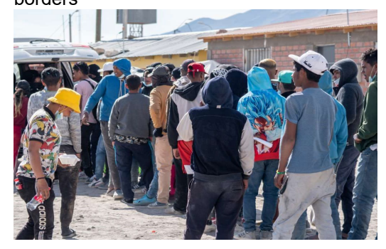
Refugees and migrants in the Chilean border receiving food

UNHCR has closely followed up on these developments and has been monitoring the situation in the north of Chile, in a context of continuous irregular arrivals via Bolivia in extreme vulnerability with the harsh climatic conditions of the northern part of the country, where the nights are cold and temperature drops quickly, routinely below zero and as low as -20. Some 20 deaths, including a baby, have been reported at borders