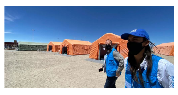
UNHCR staff monitoring refugees' and migrants' conditions at first reception center in Colchane.