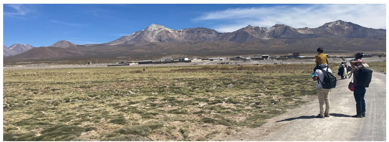
Refugees & migrants from Venezuela arriving in Chile after crossing the Bolivian - Chilean border

In these first reception centers, there will be health personnel and will provide health care and manage the isolation of people, given the context of COVID-19 and refugees and migrants will self-denounce declaring their irregular entry into the country, prior to their transfer to the sanitary residences/quarantine shelter.