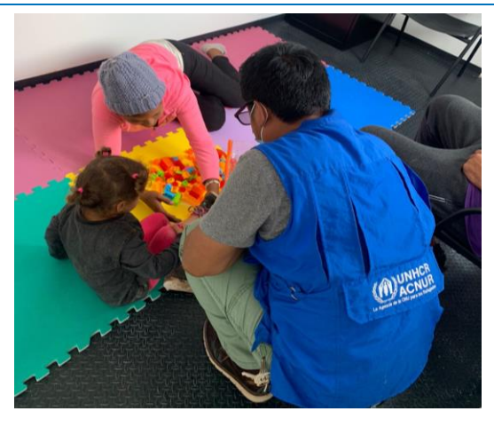
People assisted at the new Attention Center for Migrants and Refugees (CAPMiR) in Esquipulas.