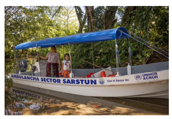
Water ambulance, "Ambulancha" in Izabal.

community, transporting women with OB/GYN needs to specialized services in Livingston, the nearest town.