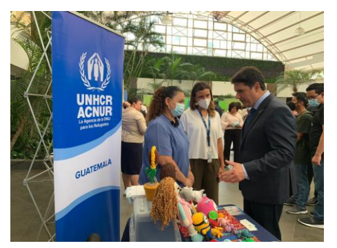
Entrepreneurship fair organized by the Municipality of Guatemala.

To promote the economic inclusion and self-reliance of refugees, asylum-seekers, and returnees, UNHCR, and its partners implement three livelihood programs: