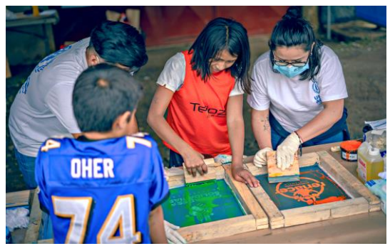
Peaceful coexistence fair in Villa Nueva.

Within the framework of the Cities of Solidarity initiative and together with the Municipalities of Guatemala and Villa Nueva, UNHCR has carried out activities of peaceful coexistence and inclusion aimed at asylum-seekers, refugees, and host communities, such as the making of murals, night bike tours, Turibus around the city, peaceful coexistence fairs with sports and recreational activities.