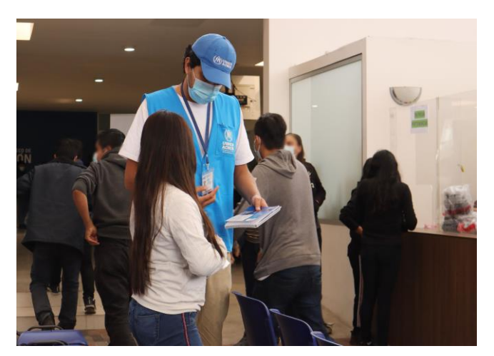
Identification of protection needs for returnees at the Guatemalan Air Force.