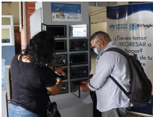
Phone charging station at the Center for Returnees in Tecun Uman.