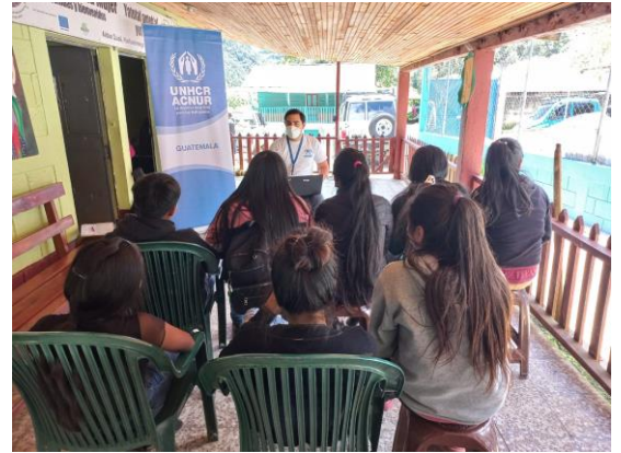
Participatory assessment in the community of Quisil, Huehuetenango.