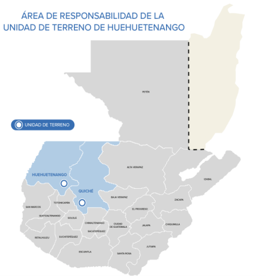
Type of Assistance Provided

The Field Unit's area of responsibility is characterized by being multi-ethnic, multicultural and multilingual with the majority being indigenous. In addition, it has two official borders and many irregular crossings into Mexico, making it a strategic point of human mobility in Guatemala.