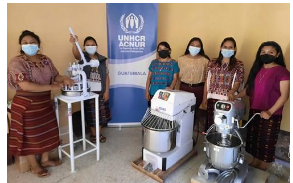
UNHCR and its partners donated equipment to the Municipal Training Centers in Huhuetenango.