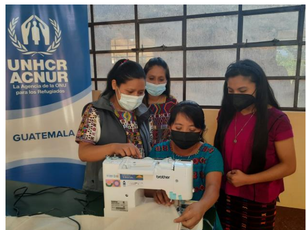
Female entrepreneurs assisted.