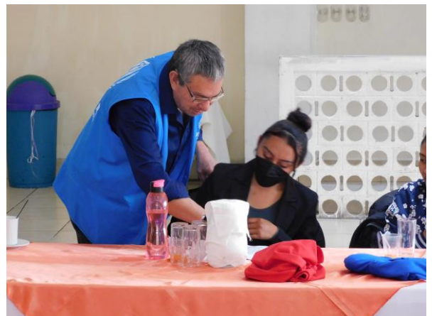
Training provided to individuals assisted by UNHCR in Huehuetenango.