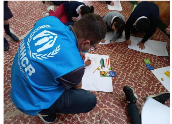
Social and peaceful coexistence activities with students in Huehuetenango.