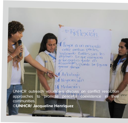
UNHCR outreach volunteers discuss on conflict resolution approaches to promote peaceful coexistence in their communities.