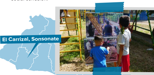
El Carrizal, Sonsonate