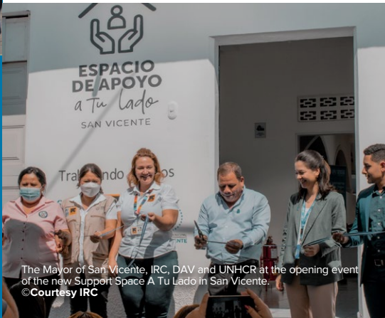
The Mayor of San Vicente, IRC, DAV and UNHCR at the opening event of the new Support Space A Tu Lado in San Vicente.

UNHCR supported the Women's Development Institute (SDEMU) in the inauguration of a Specialized Care Centre in Sonsonate and through 253 hygiene and clothing kits donated in support to displaced women survivors of gender-based violence.