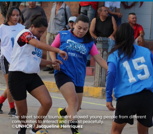
The street soccer tournament allowed young people from different communities to interact and coexist peacefully.

Twenty-six authorities and outreach volunteers attended a session organized by UNHCR and COMCAVIS Trans on the protection of LGBTIQ+ persons and non-discrimination. Delegates from San Salvador's Department for the Prevention of Violence, the National Youth Institute, the Ombudsman's Office, the Republic Attorney General's Office and outreach volunteers were among the attendants.