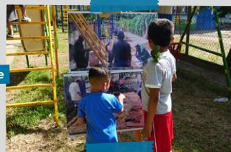
Children play in the new park at El Carrizal community, in Nahuizalco, inaugurated by UNHCR and FUNDASAL.